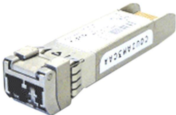
Figure 1. Cisco 10GBASE SFP+ modules

The Cisco® 10GBASE SFP+ modules (Figure 1) give you a wide variety of 10 Gigabit Ethernet connectivity options for data center, enterprise wiring closet, and service provider transport applications.